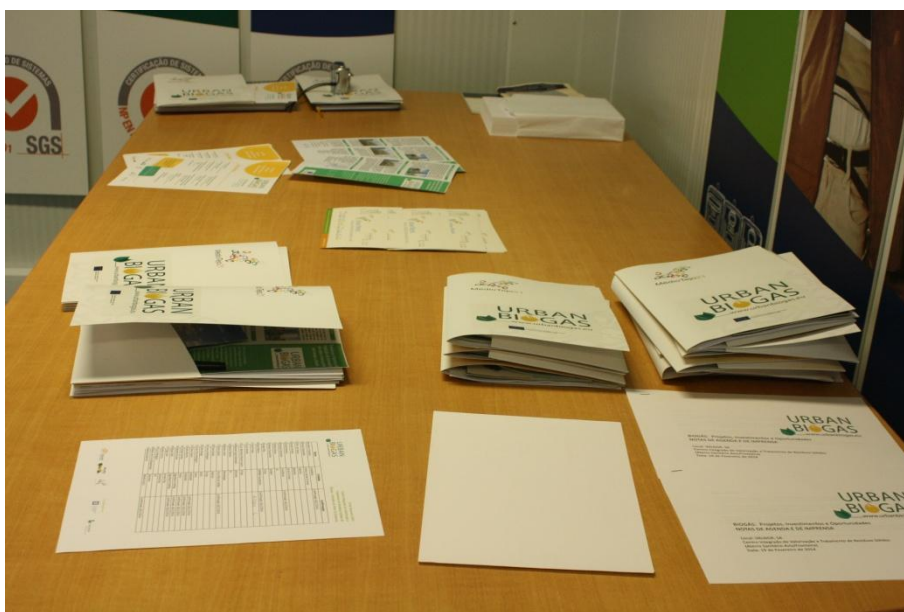
Picture 1 - Dissemination of Urbanbiogas in the event

The event covered different types of groups from municipalities, energy agencies, local companies and stakeholders interested in biogas' projects, investments and opportunities.