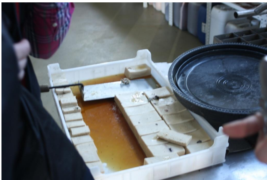
Picture 25 - Visit to Valnor - soaps