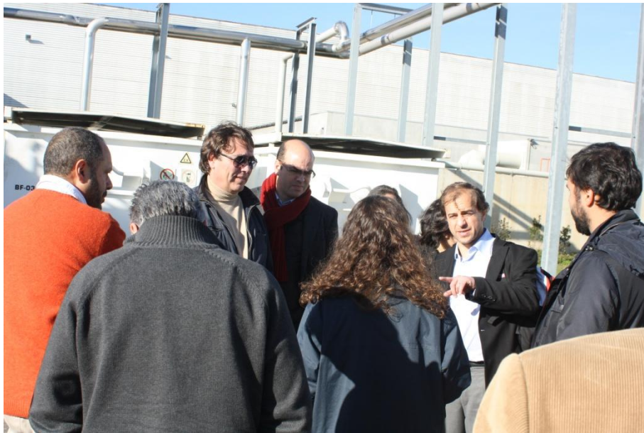
Picture 19 - Visit to Valnor