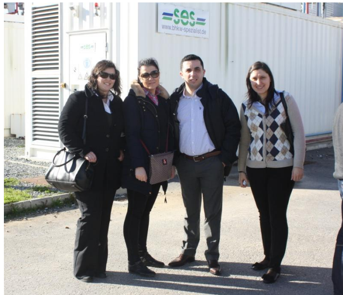
Picture 20- Visit to Valnor

The visit ended with an explanation on the biodiesel produced and used in Valnor's fleet.