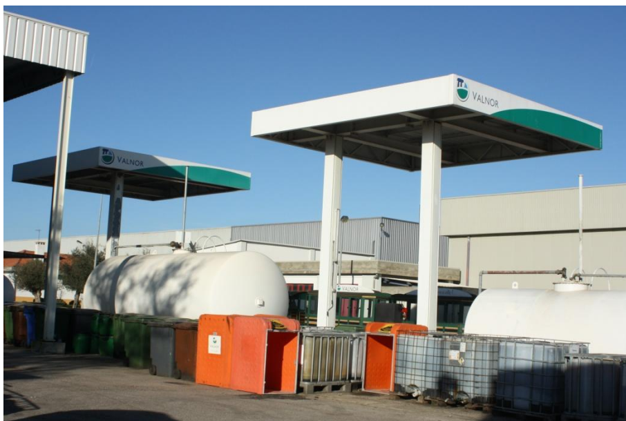
Picture 23 - Visit to Valnor – biodiesel