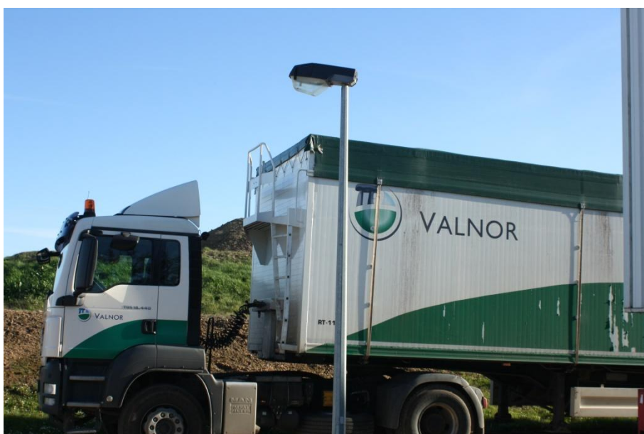
Picture 24 - Visit to Valnor

Valnor also reuses the used cooking oils to make soaps.