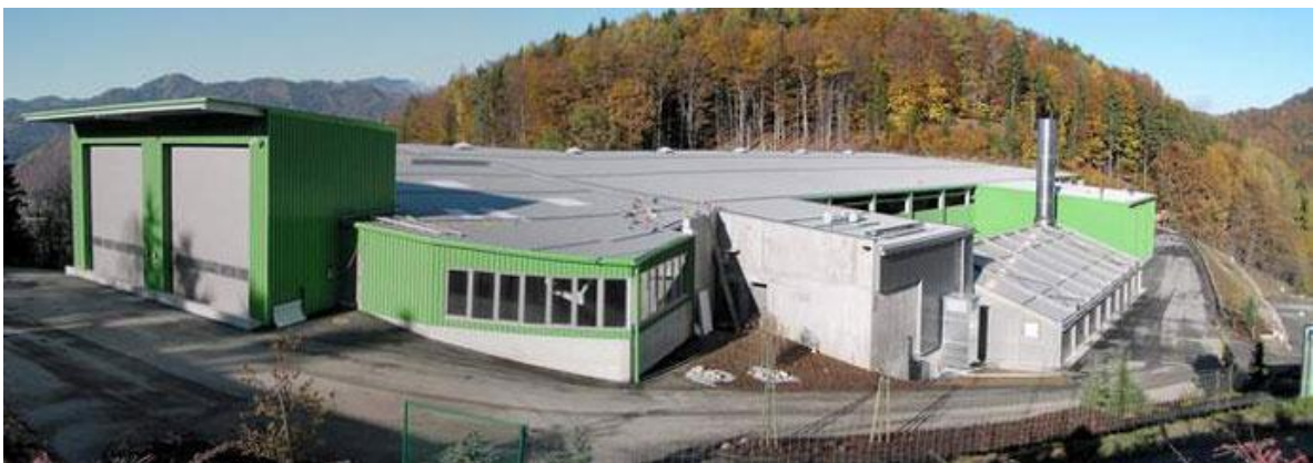
MBA Frohnleiten